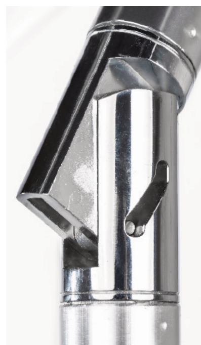
COMMERCIAL AUTO TILT