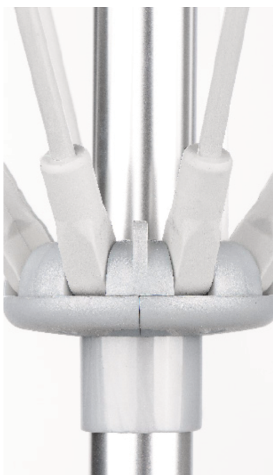
1.5" DIAMETER CENTER POLE

We use a stainlesssteel grommet at the top of the notch to keep the fabric in place and prevent rust stains. This exceptional umbrella will perfectly complement any outdoor setting!