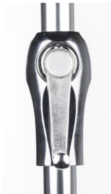
COMMERCIAL CRANK SYSTEM