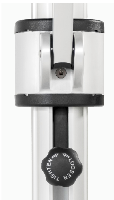
INFINITY TILT SYSTEM