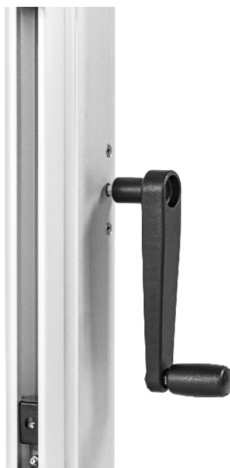
SILENT CRANKING SYSTEM