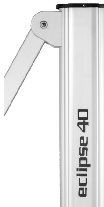
EXTRUDED ALUMINUM JOINTS