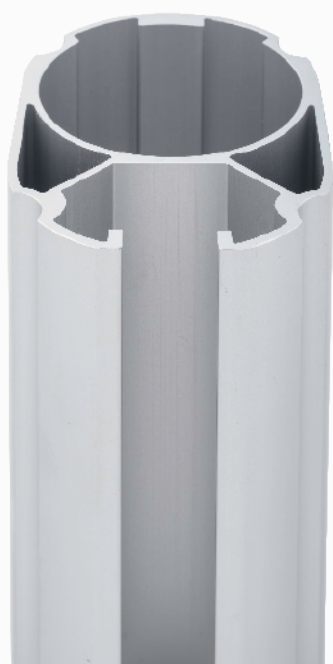
EXTRUDED ALUMINUM MAST

Heavy gauge aluminum and stainless steel parts on a marine grade corrosion resistant aluminum frame ensure the Eclipse is ideal for all environments.